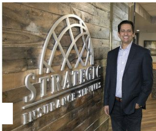
Teamwork makes the dream work!