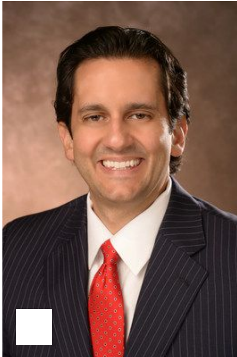
Dream Big! Make it Happen!