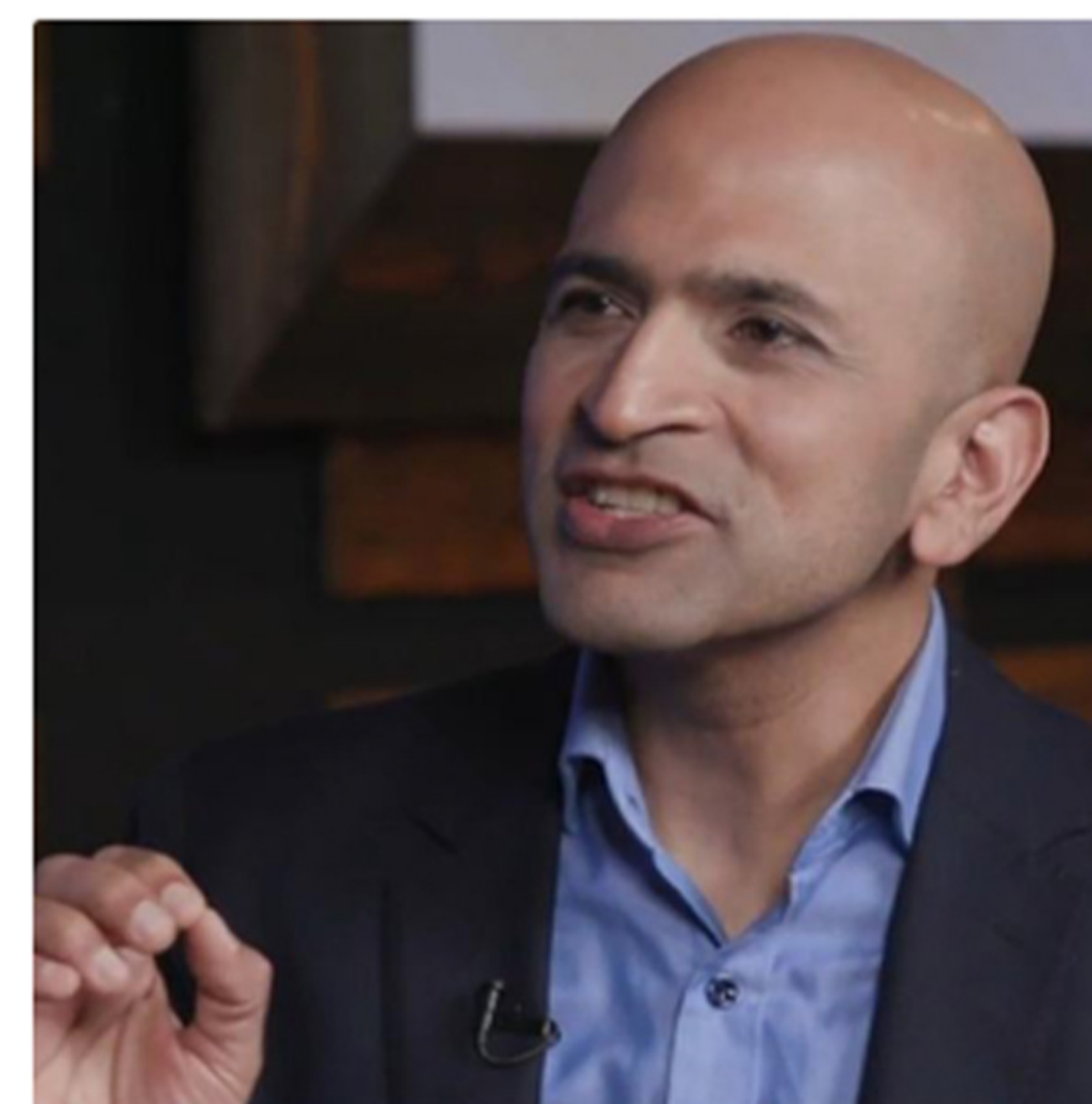
$10 Stock You Should Buy Today