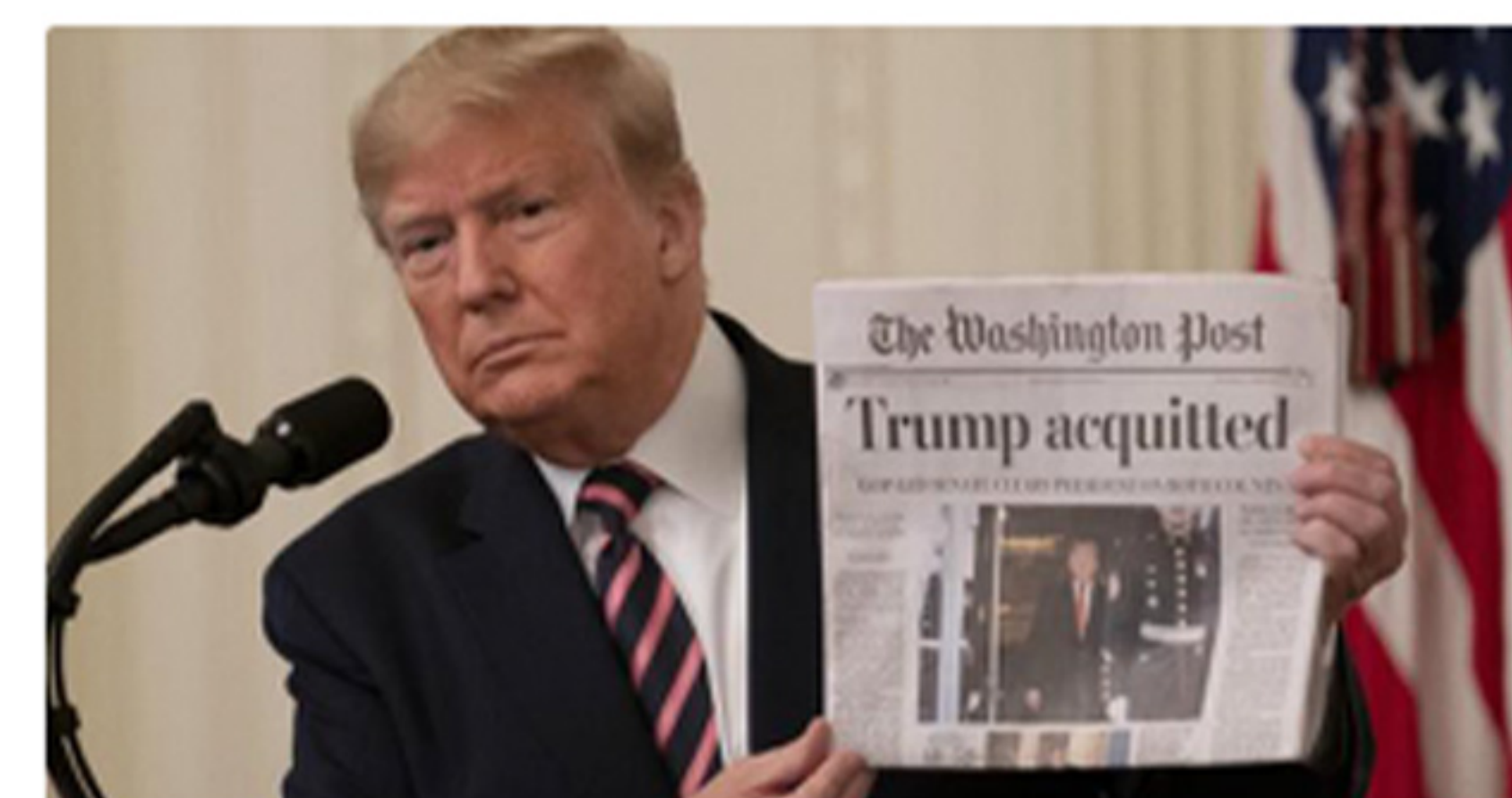
Economic indicators suggesting Trump will get re-elected Yahoo Finance